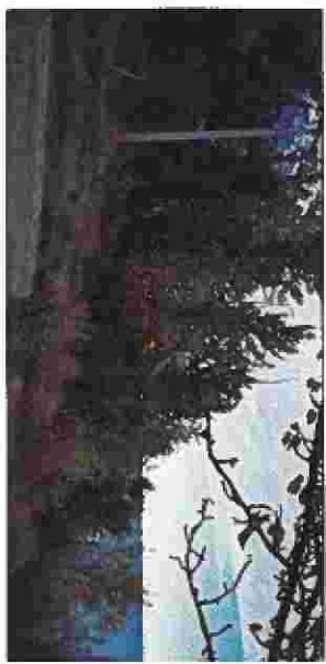
Lake Front Lots at Canyon Creek on Lesser Slave Lake