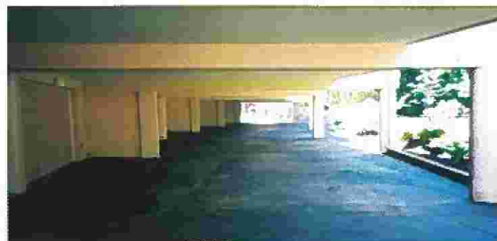
Under Building Garages