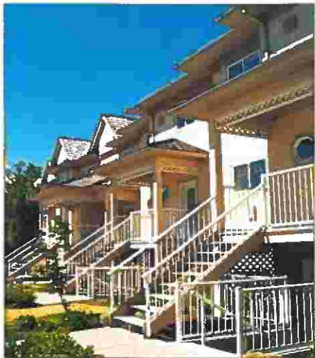
Each unit will be sold regardless of price!

DEXTER LANDING is a seven unit, two storey townhome project constructed approximately two years ago, in Kelowna, B.C. Six of the townhomes are offered for sale by Auction. The units are new and have not been occupied. The property is fully landscaped and has underground sprinklers. The large lawn and flower garden area face onto Mill Creek for the very best in privacy and view. A common lane at the side of the development provides access to the rear driveway under the townhomes, leading to the built in garages for each unit. The development is across the street from older single family homes which have been designated for future residential development. The interiors are traditional plans of approximately 1,810 sq. ft. plus 600 sq. ft. of double garage. There are also 2 large balconies. Features include 8'9" ceilings with custom moldings and detailing, archways and interior columns, natural gas fireplaces, maple cabinets, custom drywall detailing, 2 bedrooms and den (loft), 3 bathrooms and air conditioning. There is a 5 year B.C. Government New Home Warranty on each townhome.